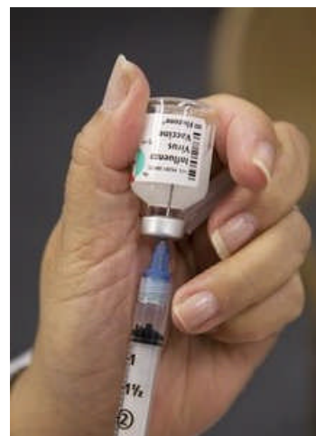
AP - FILE - This Oct. 5, 2007 file photo shows a nurse filling a syringe with a flu vaccination at a CVS pharmacy ...

illnesses from the new swine flu virus would drop if the pandemic peters out or if efforts to slow its spread are successful, said CDC spokesman Tom Skinner.