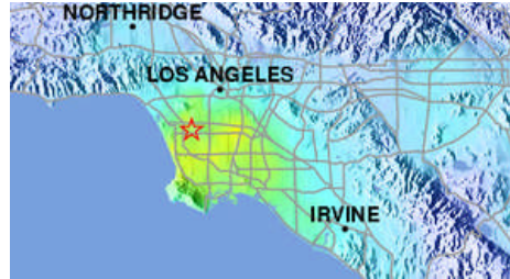
USGS A magnitude-4.7 earthquake, shown on this USGS map, triggers shaking throughout the LA area Sunday night.

A magnitude-4.7 earthquake rattled the Los Angeles area Sunday night, marking the strongest quake to hit LA since July, and experts say stronger quakes are on the way.