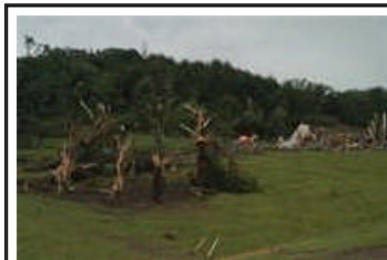
Firefighters search the wreckage at the Little Sioux Scout Ranch after a tornado ripped through the... Full Image