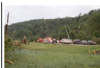
(AP) Emergency vehicles line up in the rescue effort at the Little Sioux Scout Ranch can be seen after a... Full Image

alternate emergency site," Zeller said. "We are just trying to regroup. When you don't have all of your equipment and you don't have all your facilities to operate out of - we're at a little bit of a disadvantage ... but we're carrying on as normal."