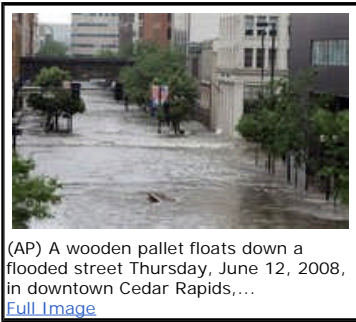
(AP) A wooden pallet floats down a flooded street Thursday, June 12, 2008, in downtown Cedar Rapids,...

The surging river caused part of a railroad bridge and about 20 hopper cars loaded with rocks to collapse into the river. The cars had been positioned on the bridge in hopes of weighing it down against the rising water.