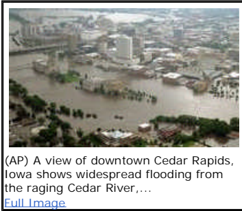
(AP) A view of downtown Cedar Rapids, Iowa shows widespread flooding from the raging Cedar River,...

Officials estimated that 3,200 homes were evacuated and some 8,000 residents displaced.