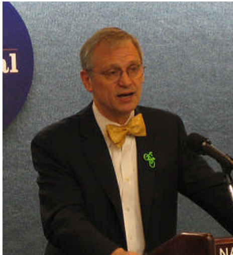
Rep. Earl Blumenauer, D-Ore.

An Oregon congressman says he wants to test having a government GPS unit in every car so a tax could be imposed on the miles driven.