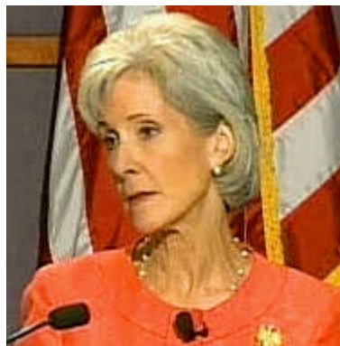
Health and Human Services Kathleen Sebelius

And when you are sick, do not spread germs to others by going out in public.