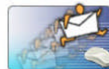
Subscribe to VOA Email News